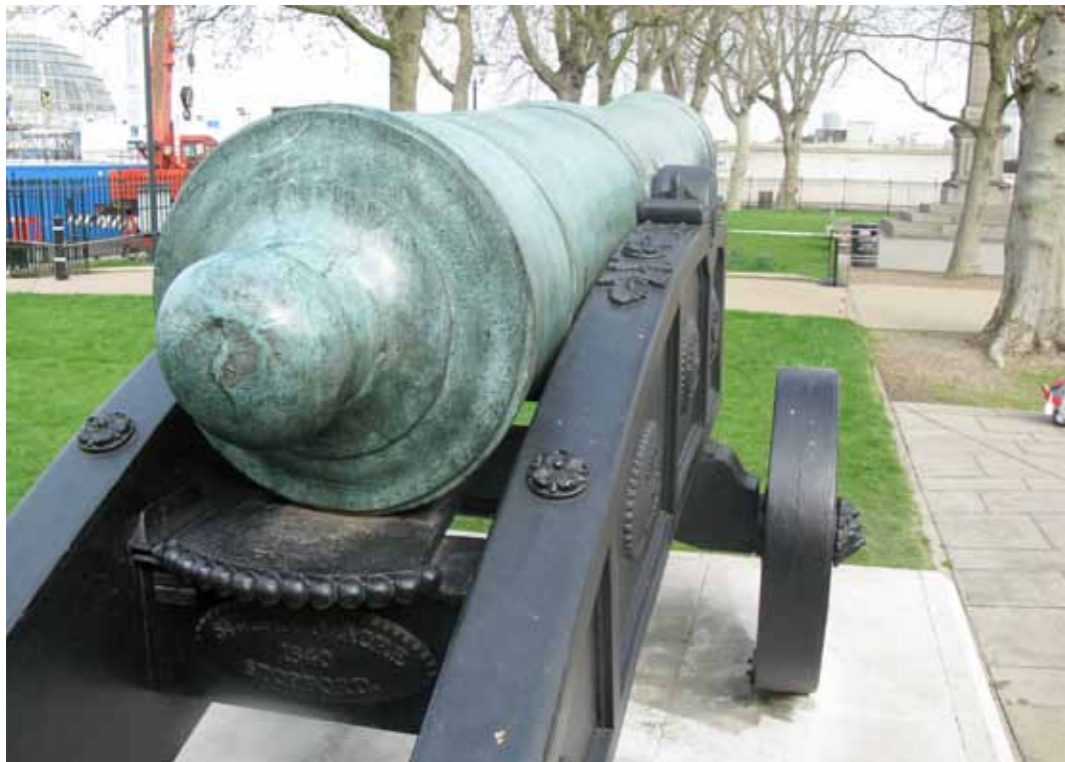
17th century bronze cannon at the NMM—showing the natural patina with a wax coating and cast iron display carriage (circa early 1800s) coated in a 2-pack paint system

The majority of large outdoor objects, made of wood or any metal that corrodes, are usually high-pressure water blasted then sealed with a 2-pack paint system with various types of application depending on the manufacturer. Relatively inert metals like gunmetal, bronze and copper are usually left to patina naturally and, depending on the institution and available workforce, sealed with the wax or a proprietary varnish.