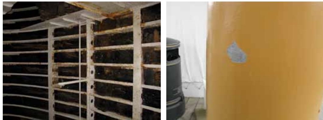
The Gannet's frames showing signs of corrosion