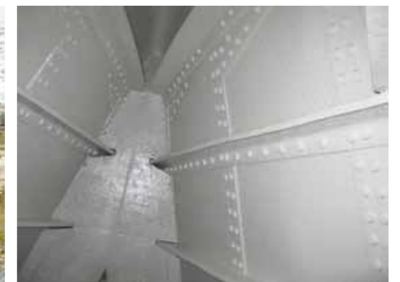
The Edmund Gardner chain locker shown after treatment (note the good condition of the steel and rivets)