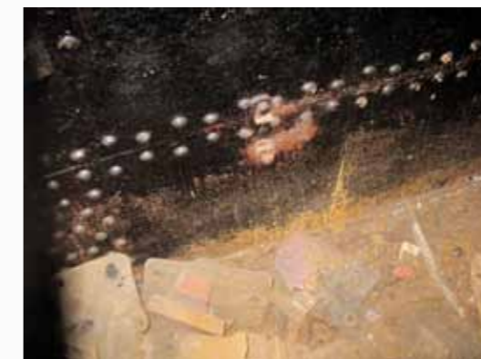
View of the Warrior's bilges showing the untreated iron ballast

The hull is in extremely good condition for its age, due to the superior quality of the iron used and the fact that it has always been afloat and working. The Navy or its sub-contractors have always maintained the vessel. Navy divers still regularly inspect and clean the underwater section of the hull and use it for training purposes.