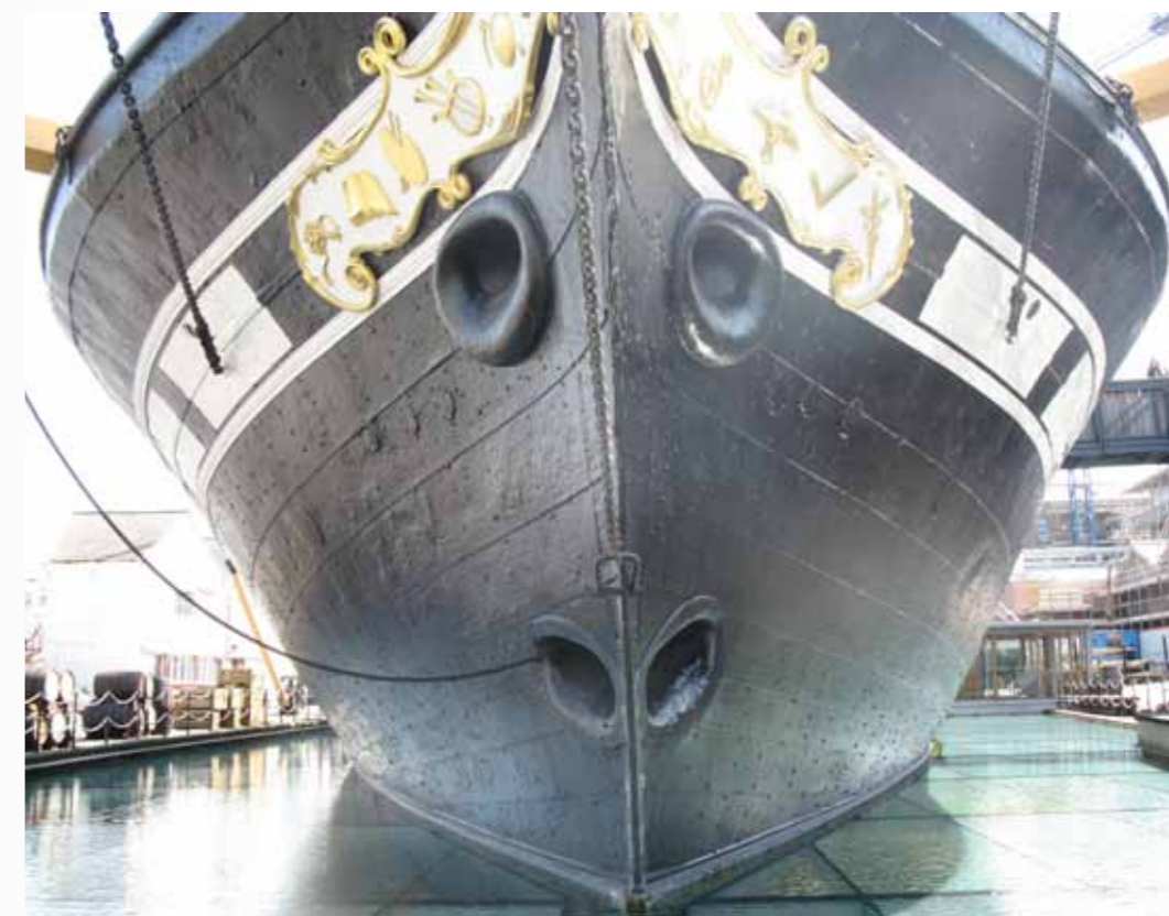
View from the bow of the SS Great Britain, above the waterline, showing the completed topside coating system and the 'glass sea'.

Interestingly, the largest moisture load on the dehumidifying plant comes from the number of visitors below deck and in the dry dock itself.