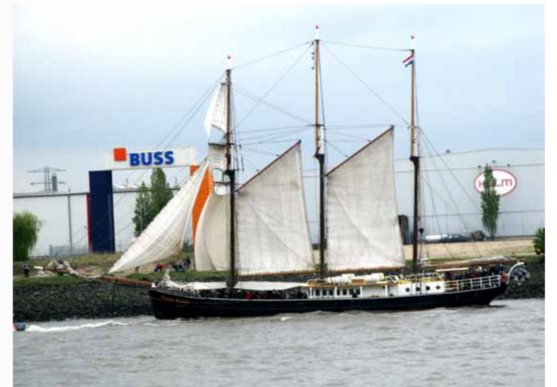
The Hendrika Bartelds, one of the historic vessels cruising the Elbe River during the Hamburg Port Festival

The research has indicated that the process of conserving/restoring heritage wrought iron large objects in an open all-weather environment is extremely complicated. The methodology used has to be well researched and must continue to be evaluated and modified throughout the life of the object by the curators and conservators. Changes in conservation technology must be brought to bear on this equation as well.