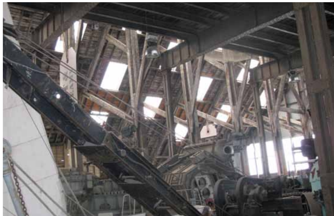
The interior of the dockyard fitting out shed showing the old shipbuilding machinery

Heritage shipbuilding machinery is stored and displayed here—either left as is under cover or coated with a 2-pack painting system if outdoors.