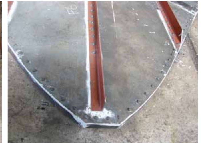
Close up of a watertight bulkhead of the Medway Queen showing new riveting work

The results of this vessel's reconstruction can only be assessed after the vessel has been in service for a number of years.