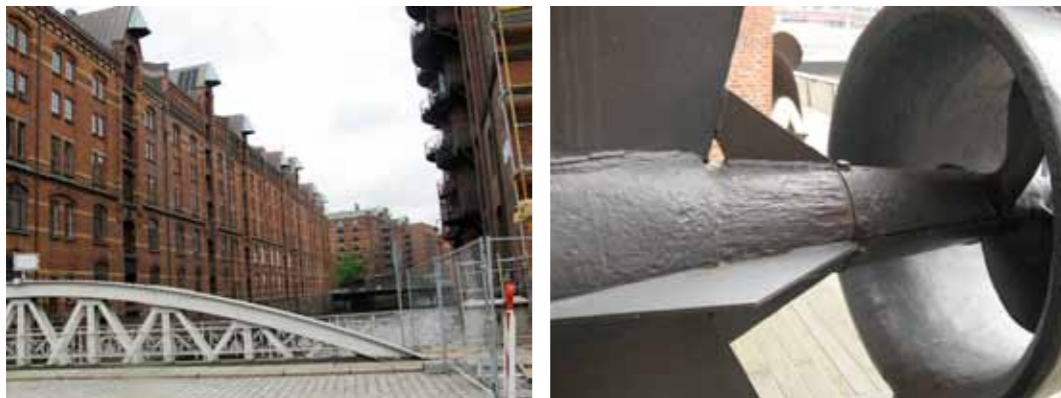
An example of a riveted wrought iron bridge, restored and incorporated into the Hamburg Port Redevelopment. Propeller and stern drive casing of a mini-sub (note the corrosion effects).

There are also many wrought iron riveted bridges and machinery that have been conserved throughout the re-development of the inner port. It was inspiring to see such a concerted effort being taken to preserve this maritime heritage and integrate it all into the new port.