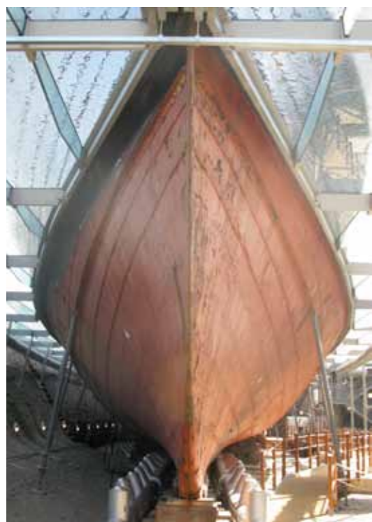
View from the bow of the SS Great Britain looking aft showing the 'glass sea' and the ducting for the dehumidified air

The ship was rescued and brought back to Bristol for conservation in 1970. Since then it has been in the dry dock that was specially designed and built for its construction.