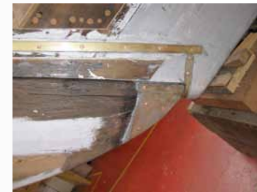
The bottom of the rudder post showing the original copper sheathing, new copper roves and new brass strengthening strips. Also note the new rudder timbers alongside the original.