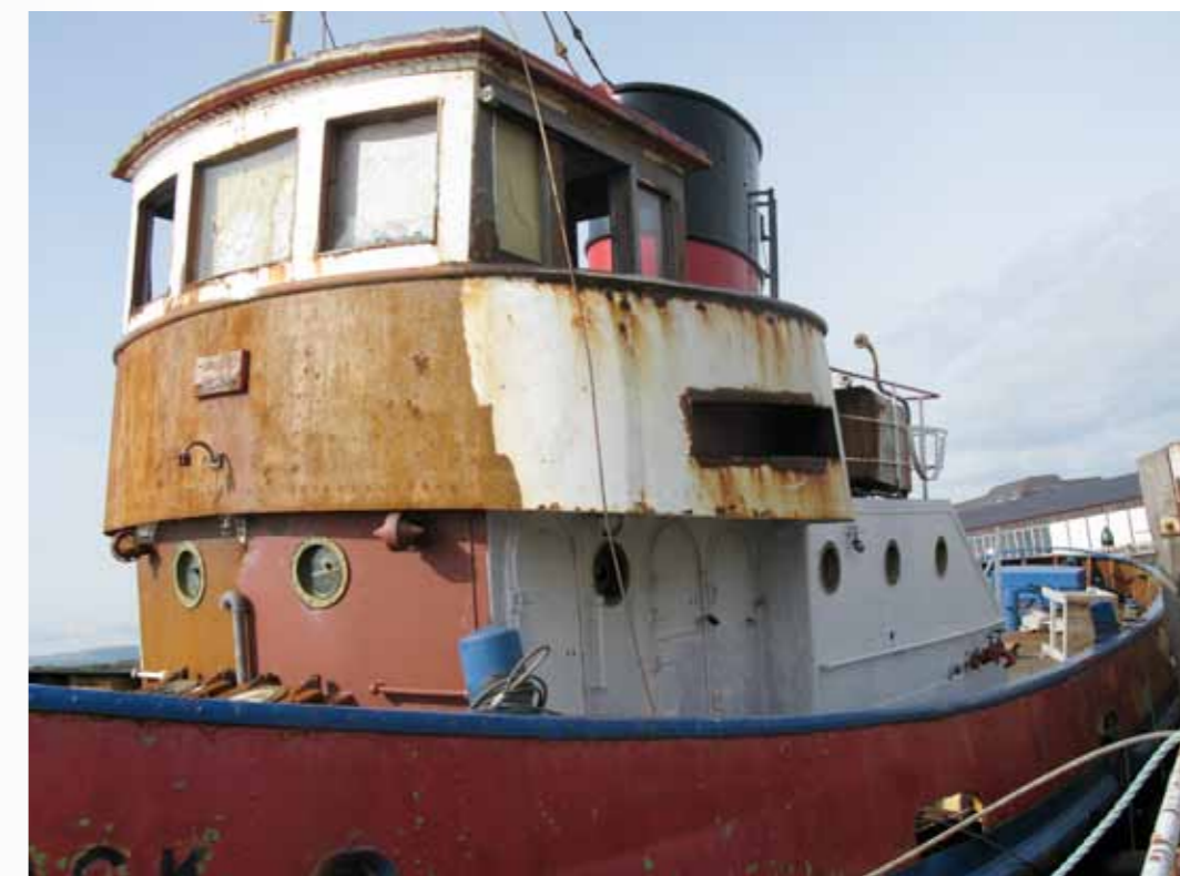
The superstructure of the Garnock

The SMM site at Irvine is home to a range of historic ship construction machinery from all over Scotland and most of this is housed in an original building called the Linthouse. The majority of the ship construction machinery is in original condition with conservation work ongoing. Some of the objects displayed outside have been coated with the traditional marine painting system described previously.