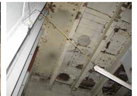
View of the Warrior's deck head in an area inaccessible to the public

The inboard parts of the vessel, which are inaccessible to the public, have not been maintained to the same extent as the exposed sections due to budgetary constraints. These will require substantial conservation work as time progresses. The lower sections of the bilge contain large amounts of iron ballast that is currently rusting away and contributing to the hull's deterioration from the inside out. In addition, coatings are failing on the deck heads and hull sides in the same areas.