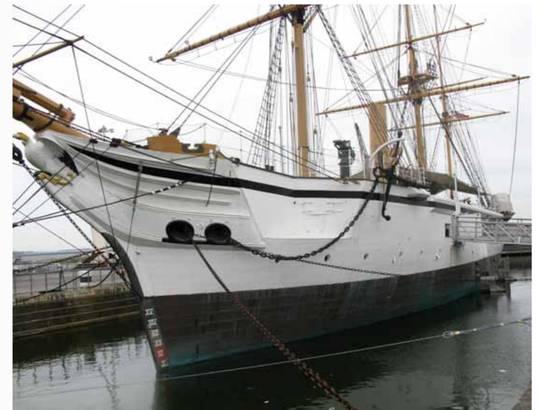
View of the Gannet from dockside

Unfortunately, the Fellow was not granted access to the lower decks of the vessel and could not evaluate their condition. The Gannet has been painted in a traditional shipyard manner.