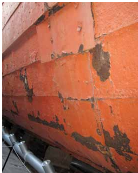
Hull section of the SS Great Britain showing previous repair work and the present stabilised condition, as seen by the Fellow