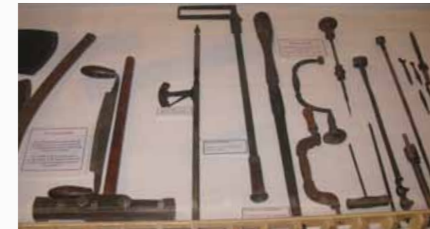
A selection of the shipwright's hand tools on display

The museum has a vast collection of traditional hand tools that are used in the shipbuilding trades on display. The library has a large collection of engineering trade manuals used by all sections of the marine industry and this valuable resource is available to the public for research purposes. It also keeps alive the knowledge and experience gained from generations of shipbuilders.