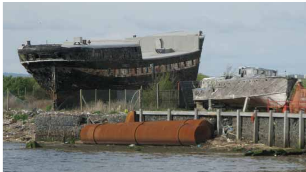
The City of Adelaide at its present site in Irvine

The vessel appears to be in a very neglected state. A covering has been fitted over the decks in an attempt to offer it some protection from the elements.