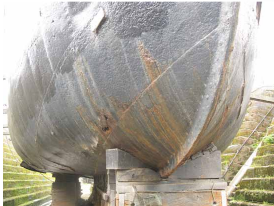
View along the De Wadden's hull showing distortion due to internal corrosion of the vessel's frames

The wasting away of material has left the vessel's structure unable to support itself both internally and externally. While there has been some internal strengthening carried out, mainly around the steps for the masts, major supporting work needs to be carried out at the earliest opportunity.