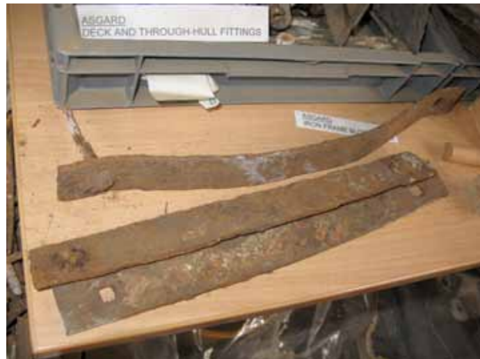
The iron butts that have suffered chloride damage are then replaced with stainless steel