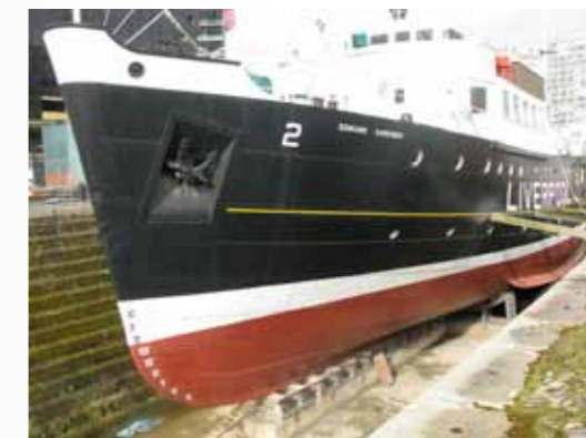
Edmund Gardner (pilot cutter) in dry dock

Constructed from steel rather than iron, the Edmund Gardner does not have a problem with chlorides. The relatively young age of this vessel means that the steel has not had a chance to corrode very much and the outside of the hull appears to be in very good condition. The paintwork also seems to be holding up well.