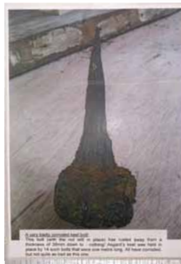
An example of a very badly corroded keel bolt. These keel bolts had to be removed and replaced with stainless steel ones