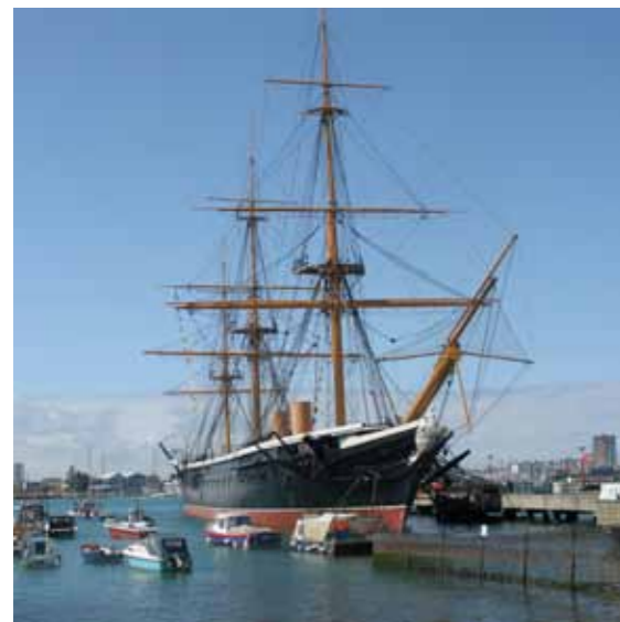
The HMS Warrior, moored at its berth in Portsmouth Harbour (part of the Historic Dockyard Precinct)

All of these entities are separate business concerns and have approached their individual conservation requirements in different ways.