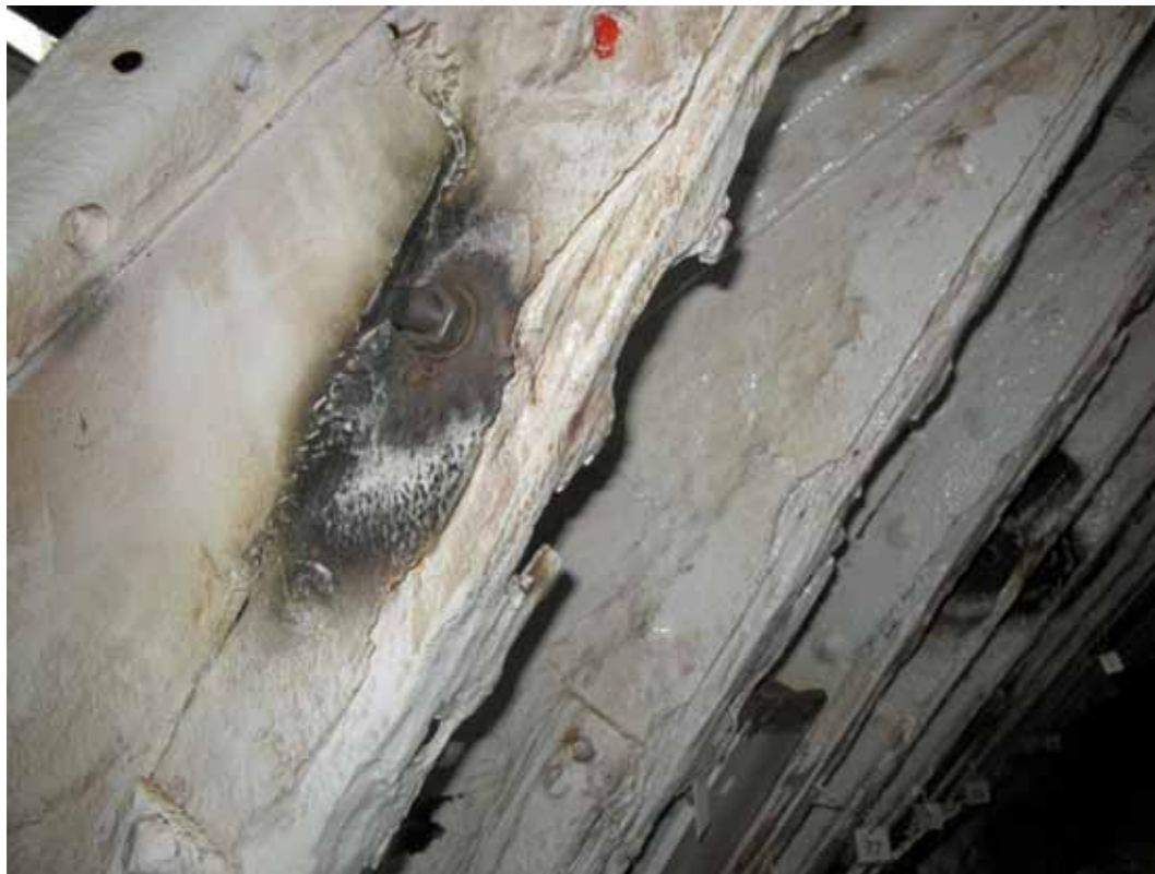
Another view of the original iron frames of the Cutty Sark showing the oxy-acetylene burn damage to the paint envelope. This damage was caused by modifications to fit the strengthening system. This will have to be addressed when all the modifications are completed.

The main objective of this conservation approach is to increase the life of the vessel for up to 50 years. The outcome of this approach remains to be seen and will have to be assessed over the long term.