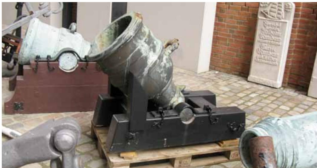
Various metal objects on display at the International Maritime Museum.

The effort and funding available for these types of large-scale conservation approaches needs to be found and implemented early in the overall plan because the trade skills and techniques required are in danger of disappearing. The International Maritime Museum is a privately owned museum of the highest standard. It has a wide range of exhibits and small vessels on display ranging from U-boat propellers and mini submarines through to industrial-scale objects from all over the world, which have been brought back to Hamburg