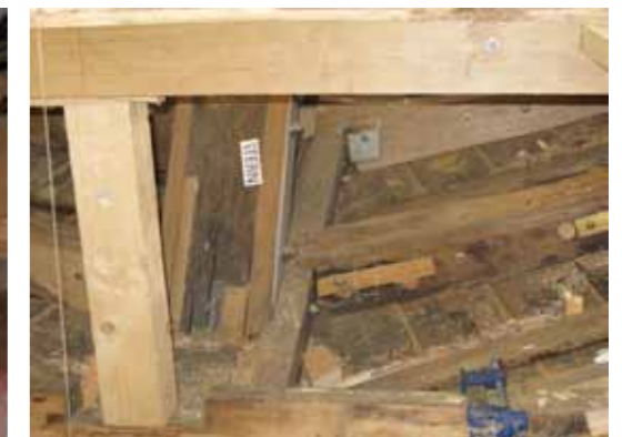
Inside the hull near the stern showing new stainless steel fixtures and fittings

This conservation project has been meticulously and thoroughly researched, and executed with an attention to detail that makes it stand out from all the other projects the Fellow observed while overseas. Correspondence between Colin Archer and Erskine Childers during the Asgard's construction has been unearthed and this has helped enormously with the conservation process. A professional film crew is on call to document the entire process.