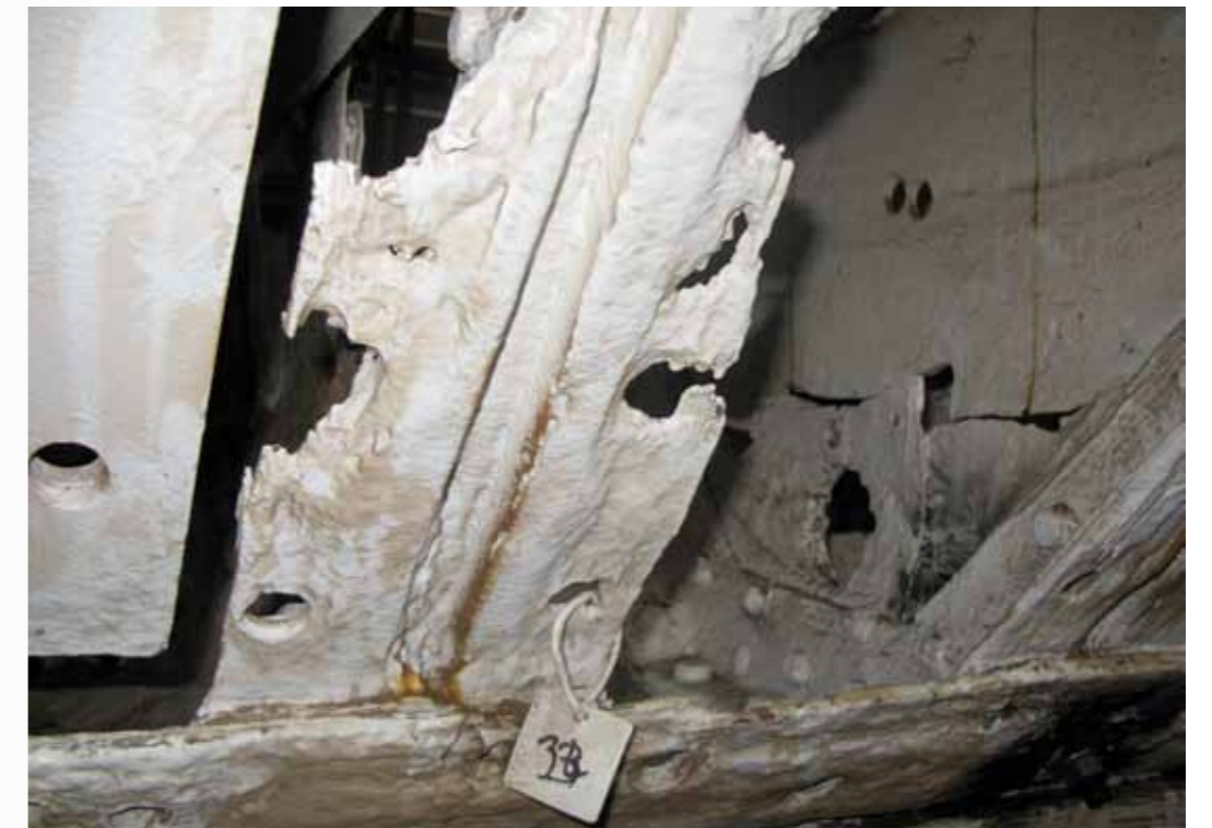
An example of an original frame of the Cutty Sark showing the extent of corrosion and wastage, with a view of a new addition alongside

The design for suspension has required some additional strengthening at various other places around the vessel's hull.