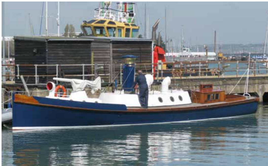
The Steam Pinnace 199 at its summer berth in Gosport

The Steam Pinnace 199 is fully self-funded by a Board of Trustees, crewed by volunteers, and maintenance work is carried out at a special-purpose workshop set up inside the Historic Naval Base. This workshop employs some traditional shipyard tradespeople, such as shipwrights and boilermakers, and is being used to train young apprentices in these fast disappearing skills. Funding comes from contract work on site and around the country for various heritage organisations.