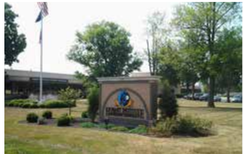
Hobart Welding School

The welding school was started in 1930 as a department of the Hobart Brothers Company. In 1940, the school was granted a charter by the State of Ohio as a 501(c)3 non-profit corporation governed by a board of directors and became known as the Hobart Trade School. As welding became more popular, the demand for trained welders increased and larger school facilities were required. In 1940, a new all-welded steel building was designed and built to house the welding school operation. Hobart Institute trained thousands of welders for World War II production in 1942-45.