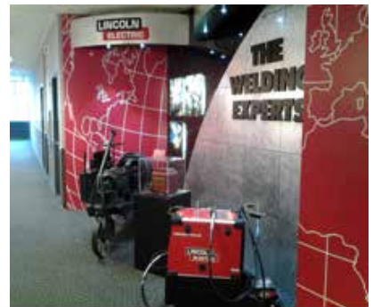
Lincoln welding museum