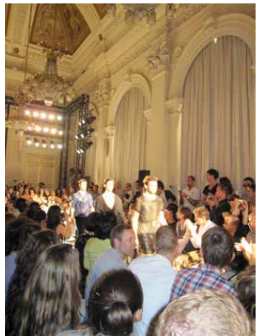
The show at La borse