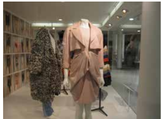
V&A graduate work

The UK Government encourages the restoration of garments because they consider fashion as art and as an important factor in understanding their cultural history. They also recommended visiting some other collections that have good holdings of contemporary fashion: Museum of London, Royal Ceremonial Dress Collection (at Kensington Palace), Fashion Gallery (in the City of Bath) and Brighton City Art Gallery and Museum.