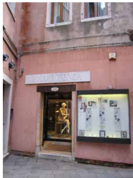
Godi fiorenza entrance