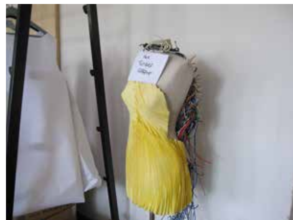
Student paper drape