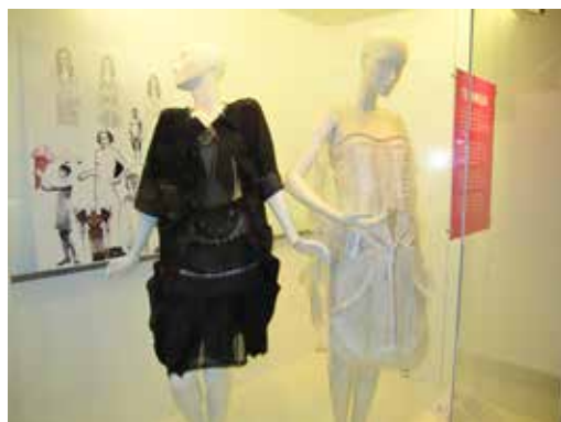
V&A graduate work