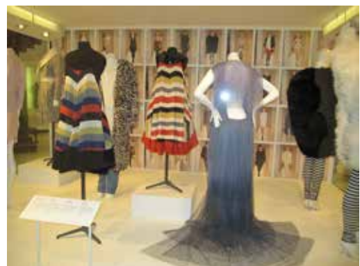
V&A graduate work