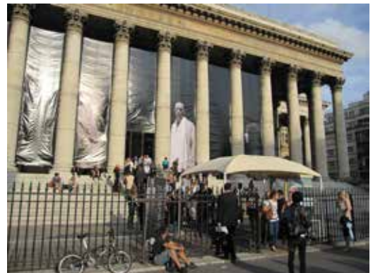
Mens wear show at Le Bourse