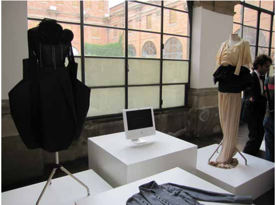
Student exhibition drape details