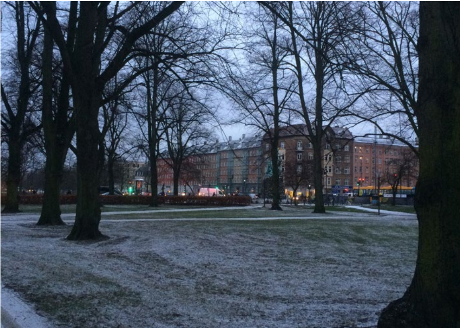
Image 1. Rigshospitalet, Copenhagen, Denmark.