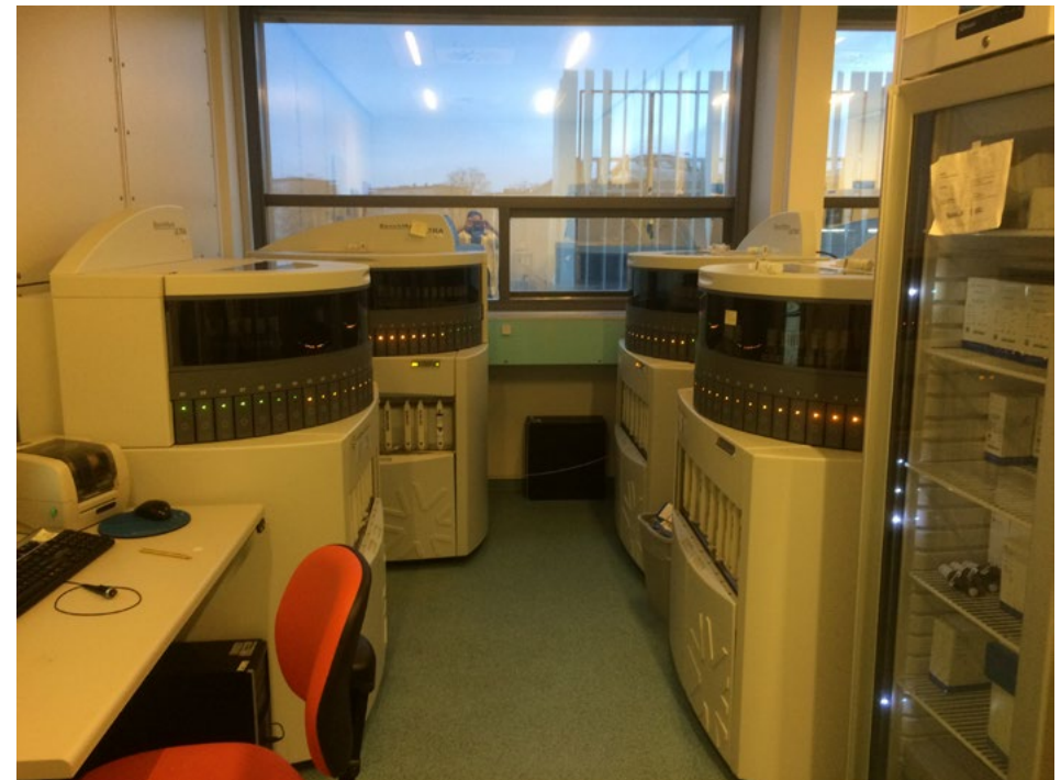
Image 3. Pathology Department machinery for processing at Rigshospitalet.

All biopsies for routine pathology, and cryotherapy, are sent to the Department of Pathology in Rigshospitalet. Here the specimens are processed into paraffin blocks, and cut at 5µm thickness and placed onto slides. Routine haematoxylin and eosin staining is performed. Immunohistochemistry of multiple stains is performed via an automated system (BenchMark Ultra), with 30 separate chambers with each having a different stain. This allows multiple stains to be performed on up to 90 slides per machine per day, with 12 machines in use.