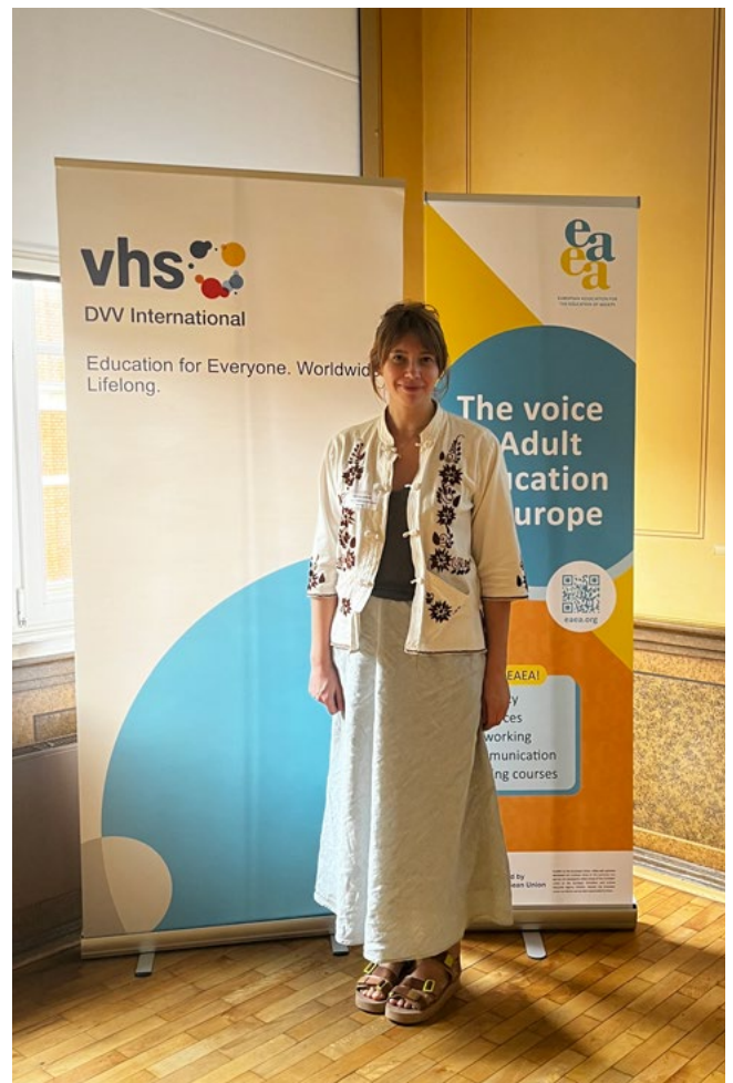
Figure 2. EAEA Conference Leipzig

This ensured the Fellowship did not impose a model, but rather made visible and strengthened systems that already existed.