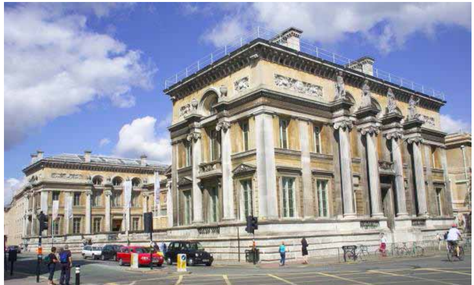
Ashmolean Museum in Oxford