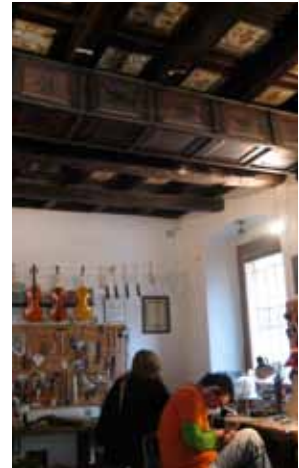
Typical workshop in the old part of the city