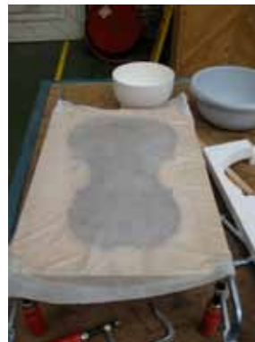
The latex sheet is laid over the belly and pulled tight to avoid wrinkles.