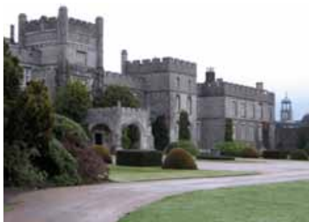
West Dean College, Chichester