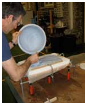
1 kg of plaster is mixed with 3 litres water (approx) and stirred for at least 2 full minutes. The mixing vessel should be tapped several times to remove any air bubbles.

The mixture is poured into the mould, when the surface of the plaster starts becoming dull setting is advanced and it should be scraped level. Clamps are removed, a layer of plastic, then another base board is placed on top and the whole cast is turned over.