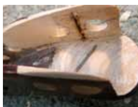
Detail of head with old neck removed. Ready for fitting above block.