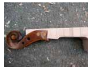
Preliminary chalk fitting