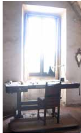
Alceste Bulfari's workshop In a 15th century church outside Cremona