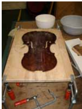
The belly is placed on the base board- if there is any distortion or twist the high edge can be supported with plasticine.

The part to be cast (belly or back removed from the instrument) is placed on the Styrofoam, a 3mm outline is traced around it then cut out. The Styrofoam mould is then cut in half length ways.