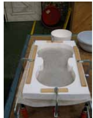
The Styrofoam mould is placed around the belly and Clamped to the base board using blocks to spread the clamping pressure.