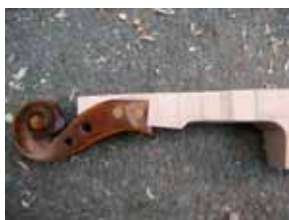
Block cut for new neck.

For detailed instructions on the procedure, please see the relevant attachment.