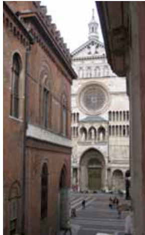
Looking across the Piazza to the Duomo in Cremona